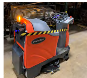
Highly visible in congested or dark aisleways