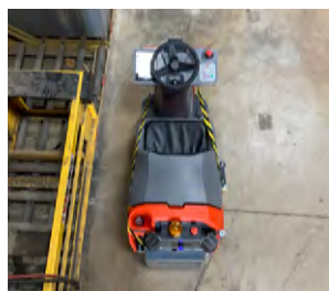
Compact design promotes superior maneuverability