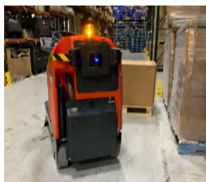
Self navigates around newly placed obstacles

Clean more areas with the ability to clean or transport through 36" doorway