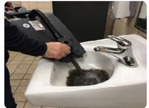
EASY TO EMPTY