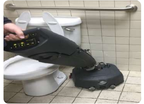
EXCEPTIONAL WATER PICKUP