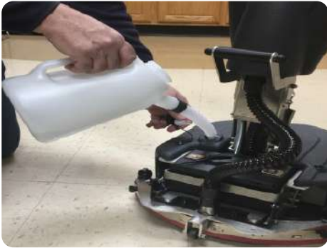
EASY SOLUTION TANK FILLING

Finally, an easy way to scrub your hard-to-reach floors.