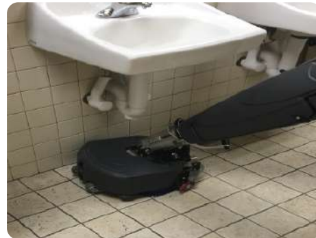
DRY FLOORS IMMEDIATELY