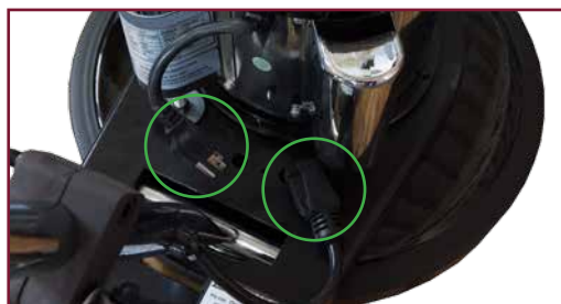
Convenient Unplug to disconnect motor for service

Mirage burnishers simplify bringing a smooth, super high-gloss luster to any hard floor surface.