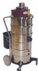
MRS 2 - for recovery of mercury contaminated dust (with U.L.P.A.)