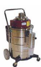
MRS 1 - for liquid mercury recovery (Includes Separator)