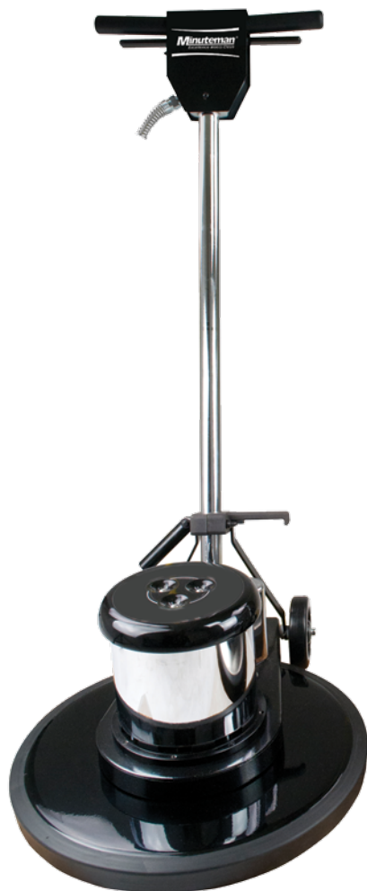
"Single speed unit shown here"