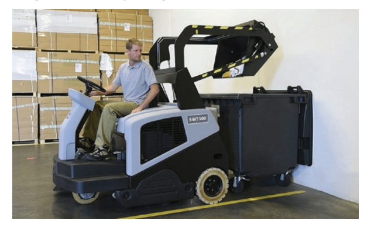
Compact overthrow design with direct throw sweeper performance.