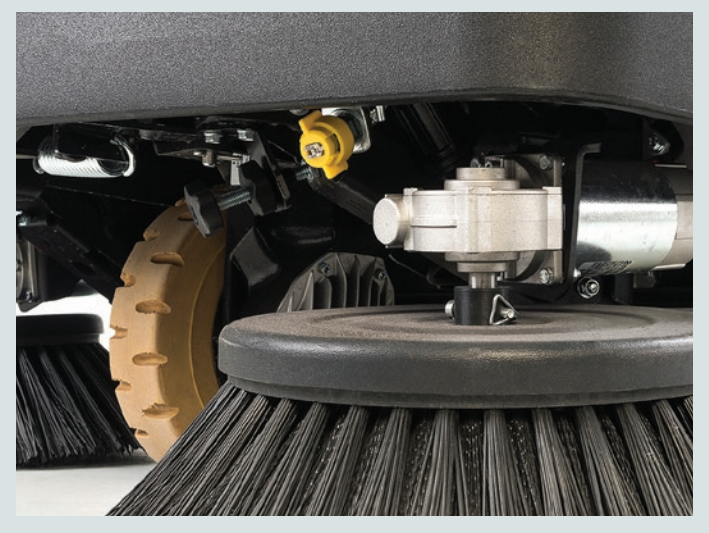
DustGuard™ minimizes fugitive dust generation and provides optimal sweeping performance.