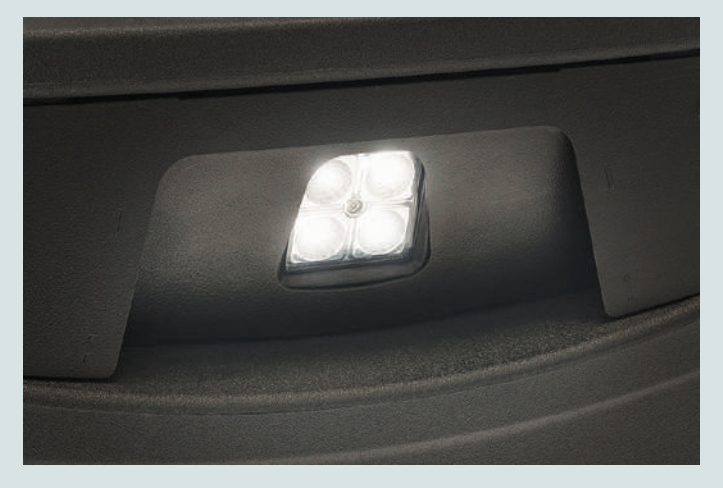
Bright LED headlights provide greater visibility in dimly lit environments.