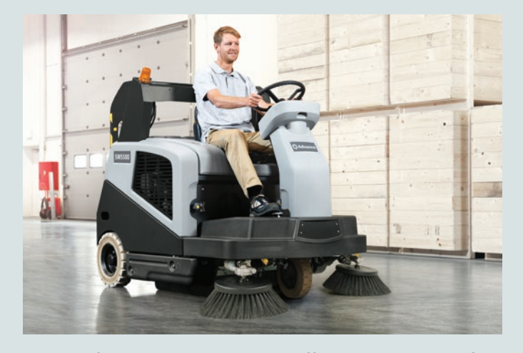
Visibility from the operator's seat offers clear sightlines for greater safety and consistent edge cleaning.