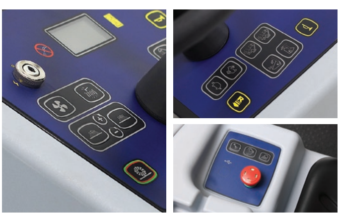
Minimal user training required.