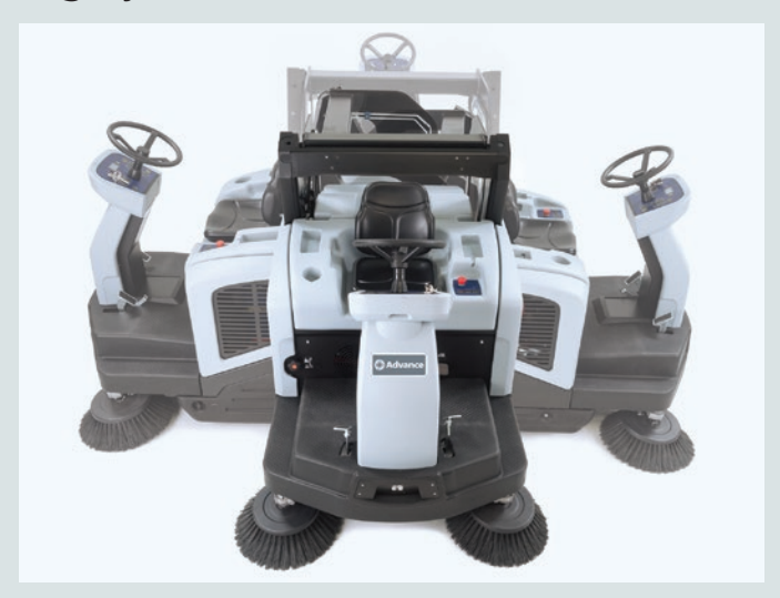
Front steering and front wheel drive with tight turning radius.