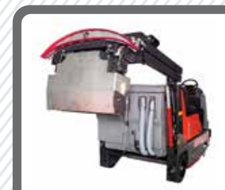
High Dump Hopper