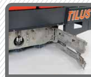
Heavy Duty Stainless Steel Components