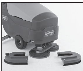
Heavy duty deck skirting system