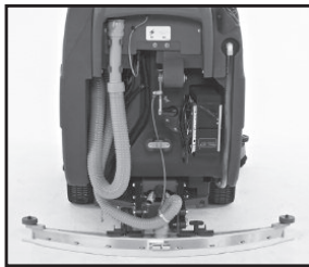
100% water pickup