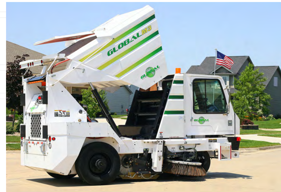
ABOVE The Global M3 is designed to make routine maintenance easy, so your sweeper spends more time on the street and less time in the garage. Two swing-out center body panels provide unrestricted access for elevator adjustment, maintenance and daily cleaning.