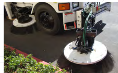
ABOVE Optional Front Articulating brush allows for extra reach to shoulders and center islands. Via In-cab joystic, the articulating front brush can be positioned on left or right side allowing for sweeping on right or left without changing seating positions.