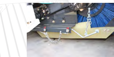
ABOVE Polyurethane Dirt Shoes will never damage while sweeping and last well above 1000 hours