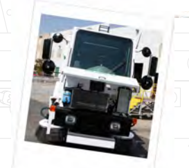
ABOVE The Global M3 features many maintenance-friendly attributes, such as a rear swing-out radiator, easy access front mounted AC condenser, brake and windshield washer fluid reservoirs, and cab fresh air filter.