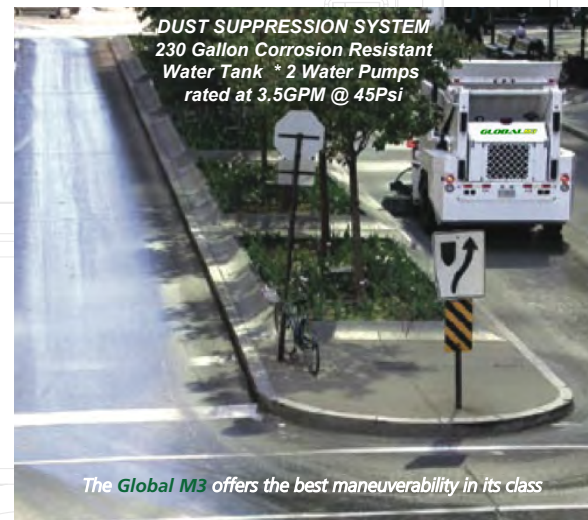
DUST SUPPRESSION SYSTEM 230 Gallon Corrosion Resistant Water Tank * 2 Water Pumps rated at 3.5GPM @ 45Psi