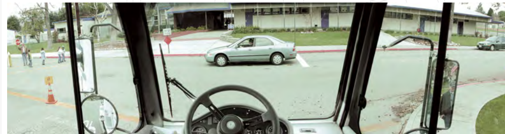
Global M3 versus old style three-wheel depth of visibility.

ABOVE Industry leading exceptional visibility increases operator and pedestrian safety over competition.