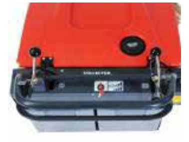
Ergonomic, User-friendly Controls ensure ease-of-use and effective operation of the machine