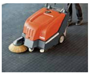
Optional: The Carpet-Kit turns the Collector 34 into a gentle, yet thoroughly efficient, carpet cleaning machine