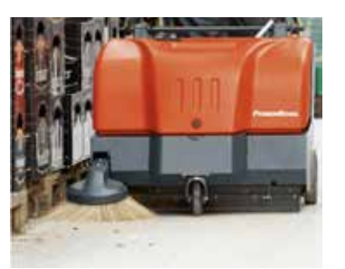
Cleaning close to edges: widely overlapping side broom provides easy working in curves.