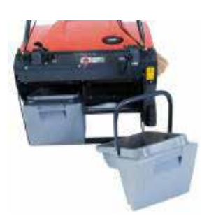
Swiveling handlebar for easy access to and opening of the debris hoppers