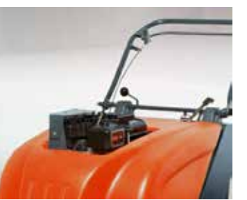
Gasoline Engine for Outdoor Use: low-consumption and low-noise industrial engine.