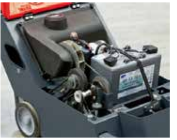
Maintenance-free batterypowered drive system: The on-board charger allows charging at any standard power outlet.