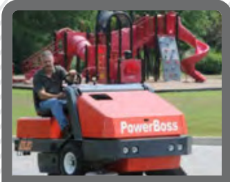
Universities • Hospitals Municipalities