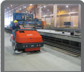
Manufacturing • Distribution