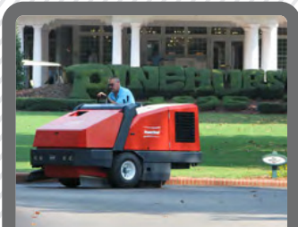
Hotels • Resorts Special Event Venues