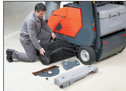
Change-out of main sweeping brush requires no tools and is quick and simple.