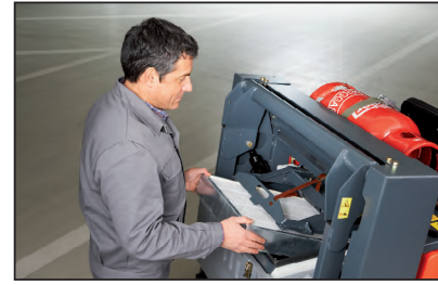
Easily accessible high performance filter system ensures clean exhaust air.