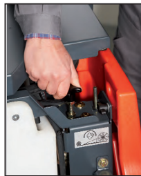
The control for the large dirt flap allows the operator to pick up large items during the course of sweeping.