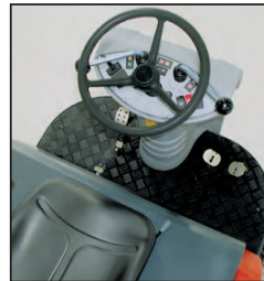
The simple design of the operator controls means less operator error.