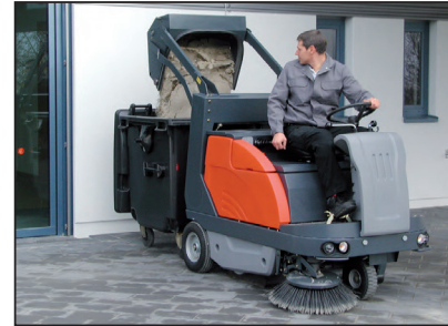
The high dump hopper can be easily emptied into large containers.