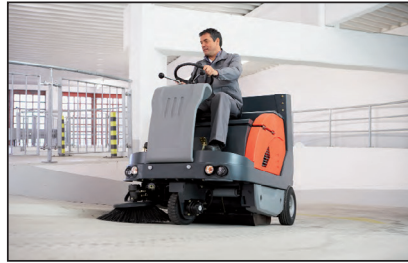
Great for use in indoor or outdoor applications because of the option to choose gas, diesel or battery operated.

Once the 34 gallon dirt hopper is full, the 60" high-dump hopper makes for easy emptying into larger containers. The hopper can be used to the full capacity because of the lifting power of the high-dump hopper.