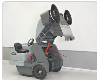
For optimal safety, the hopper safety arm can be engaged without leaving the operator seat. In addition, the sweeping systems automatically stops when the machine motion stops.