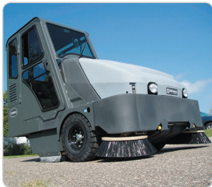
The optional all weather cab keeps the operator comfortable and productive. Clear-View™ window in the cab provides a safe view of the right side broom.