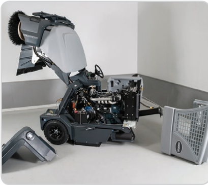
MaxAccess™ allows faster repairs and less downtime so the sweeper spends less time in the shop and more time sweeping.