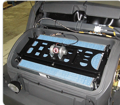
Ultra-Web® dust filter is >98% efficient on 0.3 - 1 micron dust. All dust is locked in the hopper behind only 1 critical seal incorporated in the dust filter. Captured dust is shaken directly back into the hopper.