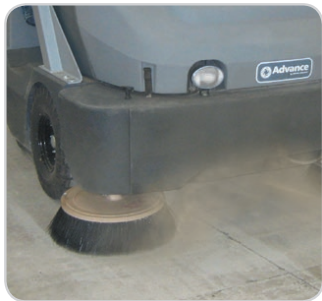
DustGuard™ suppresses side broom generated dust allowing continuous use, and increasing, dust controlled productivity by over 70%.