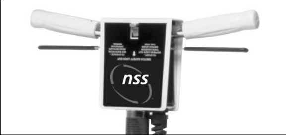
The Mustang 300 DS features a mechanical lock-out on the handle which must be released before the switch lever can be activated. This important safety feature prevents unauthorized operation if the machine is left unattended.