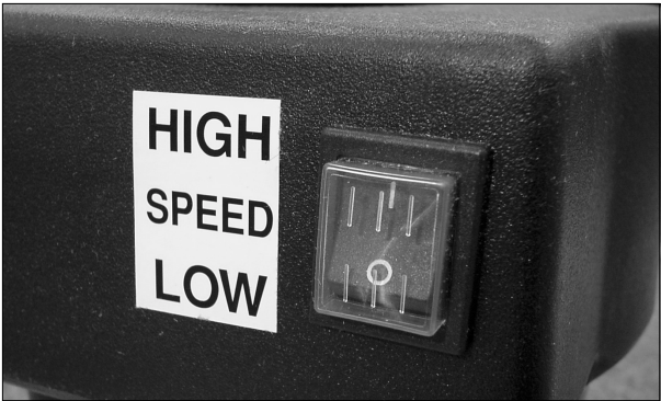
The protected toggle switch on the rear of the machine body lets you easily go from high (300 RPM) to low (180 RPM), matching pad speed to the job at hand.