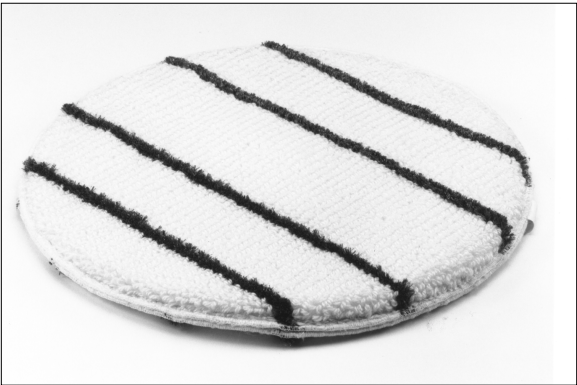
The Mustang 300 DS can be used with a bonnet (like the one pictured above) for routine carpet maintenance.