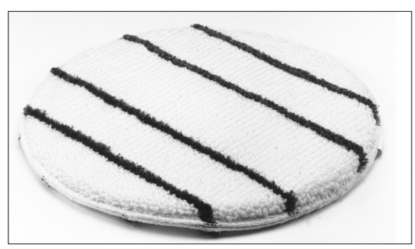
The Mustang can be used with a bonnet (like the one pictured above) for routine carpet maintenance.