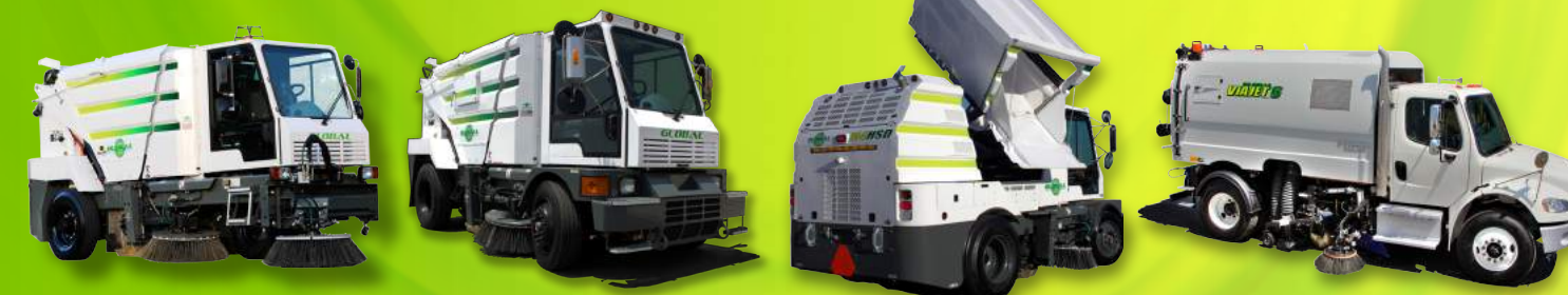
GLOBAL M3 GLOBAL M4 GLOBAL M4 Hybrid GLOBAL V6